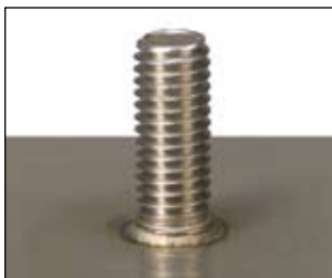
Small, regular and spatter-free collar