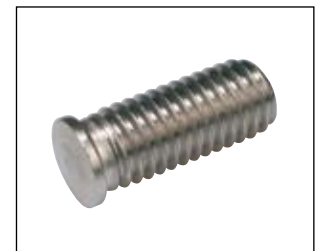
Low-cost welding studs of premium quality

SOYER top-of-the-range products awarded the following prizes for